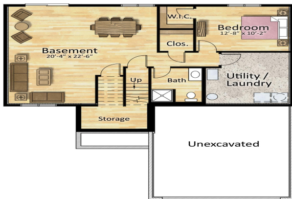
Lower Floor Plan