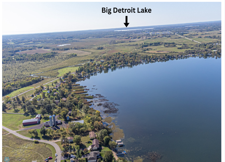
Big Detroit Lake