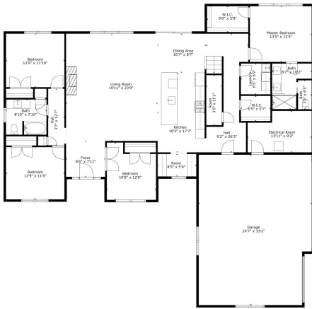
TOTAL: 2997 sq. ft. FLOOR 1: 2111 sq. ft., FLOOR 2: 886 sq. ft. EXCLUDED AREAS: GARAGE: 792 sq. ft., ELECTRICAL ROOM: 114 sq. ft. Floor Plan Created By Cuboxi App. Measurements Deemed Highly Reliable But Not Guaranteed.