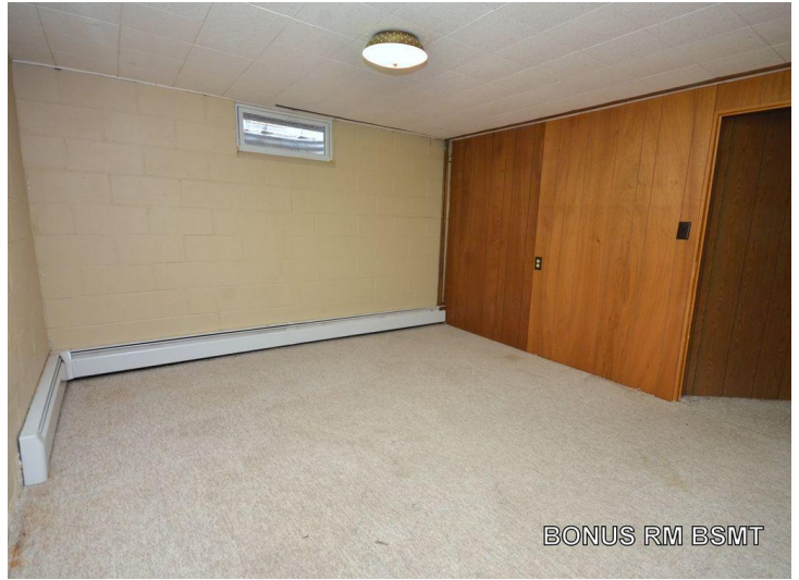
BONUS RM BSMT