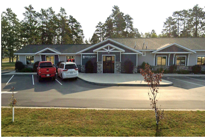
110 Mag Seven Court SW Plan Approx. 2,566sf