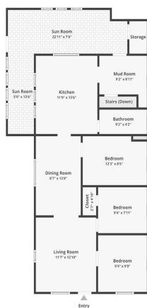
709 Mississippi Ave NW, Bemidji, MN 56601 Floor 1

Floor plan/area cannot be used for building or design purposes. Sizes and dimensions are approximate.