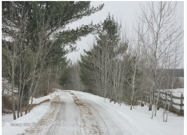
Galaxy S22 Ultra

website: www.AffinityRealEstate.com | email: info@affinityrealestate.com | office: 218-237-3333 | fax:218-237-3377