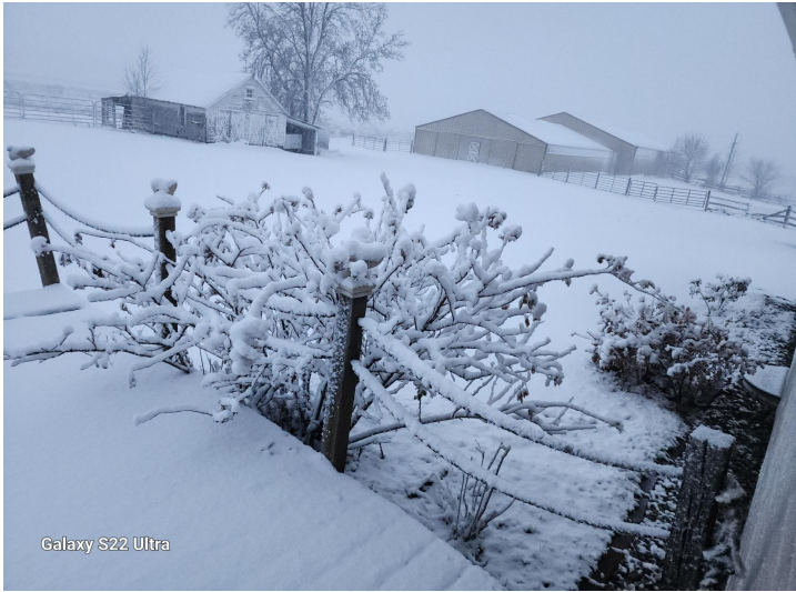
Galaxy S22 Ultra