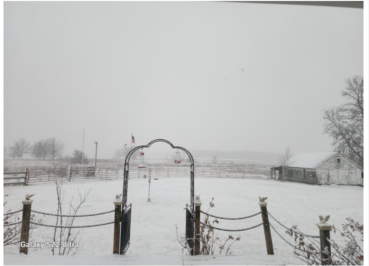
Galaxy S22 Ultra