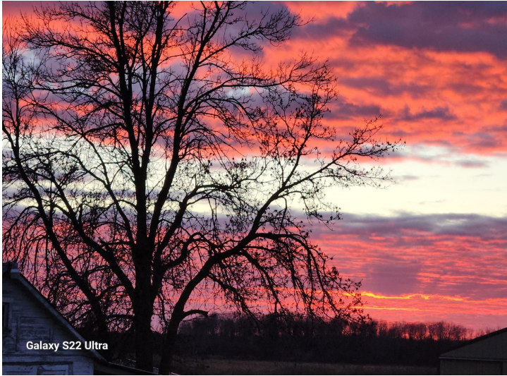
Galaxy S22 Ultra