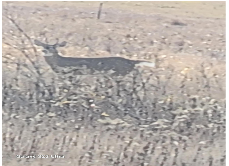
Galaxy S22 Ultra

website: www.AffinityRealEstate.com | email: info@affinityrealestate.com | office: 218-237-3333 | fax:218-237-3377