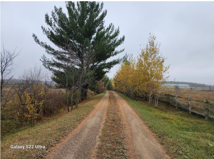
Galaxy S22 Ultra