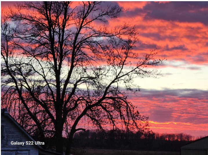
Galaxy S22 Ultra