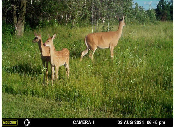
MODULTRAE CAMERA 1 09 AUG 2024 06:45 pm