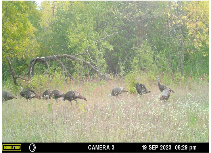
MODULTRAE CAMERA 3 19 SEP 2023 05:29 pm