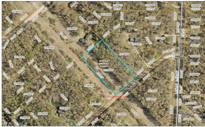
These data are provided on an "AS-IS" basis, without warranty of any type expressed or implied, including but not limited to any warranty as to their performance, merchantability, or fitness for any particular purpose. L44 B1 Navajo Trail 2.01 Acres Date: 5/24/2024 Time: 9:52 PM