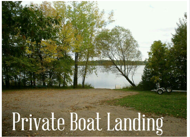
Private Boat Landing