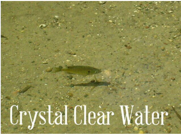
Crystal Clear Water