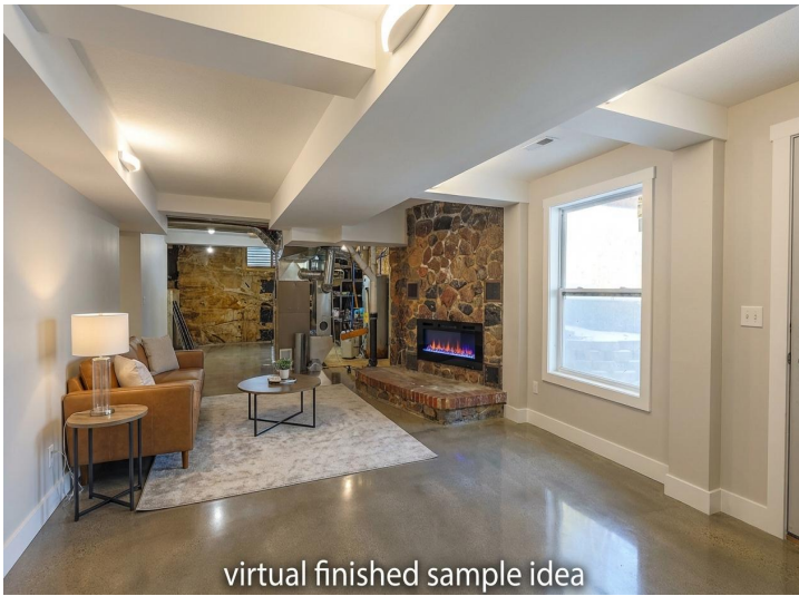
virtual finished sample idea