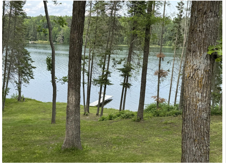
Lake Front Property Nearly 2 acres and 275 feet of shore line