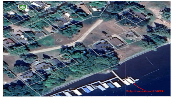
25671 Circle Dr Slip Location