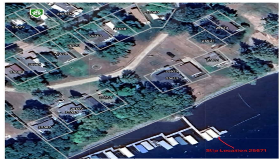
25671 Circle Dr Slip Location