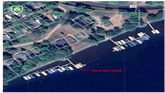
25663 Circle Dr. Slip Location

website: www.AffinityRealEstate.com | email: info@affinityrealestate.com | office: 218-237-3333 | fax: 218-237-3377