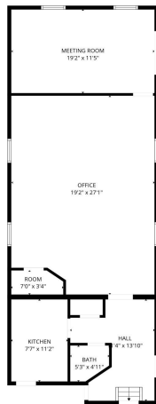
FLOOR PLAN CREATED BY CUBICASA APP. MEASUREMENTS DEEMED HIGHLY RELIABLE BUT NOT GUARANTEED.

website: www.AffinityRealEstate.com | email: info@affinityrealestate.com | office: 218-237-3333 | fax: 218-237-3377