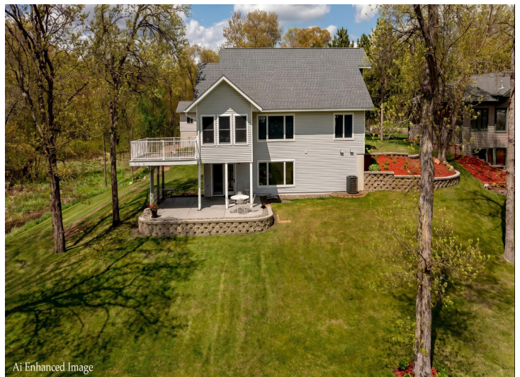
Ai Enhanced Image

website: www.AffinityRealEstate.com | email: info@affinityrealestate.com | office: 218-237-3333 | fax:218-237-3377