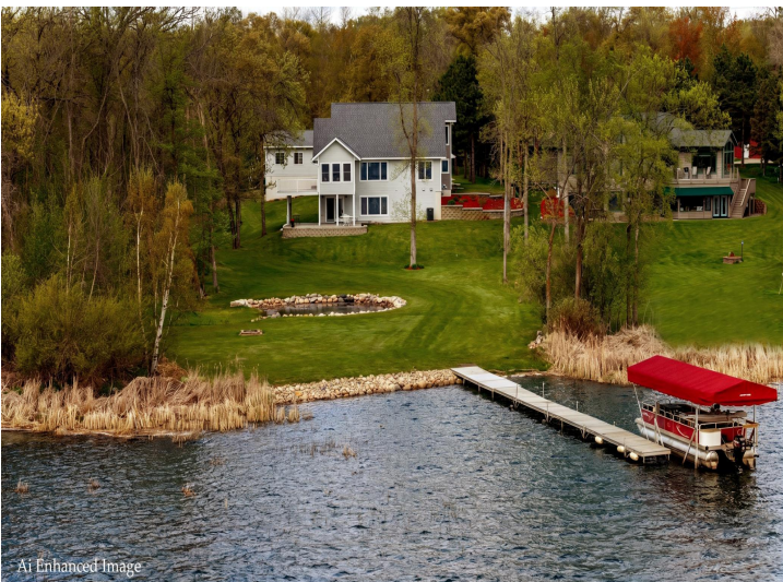
Ai Enhanced Image