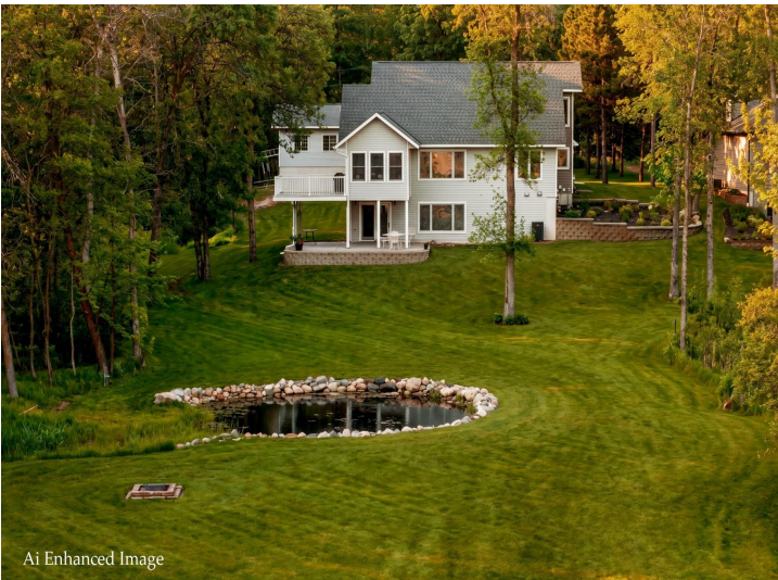
Ai Enhanced Image