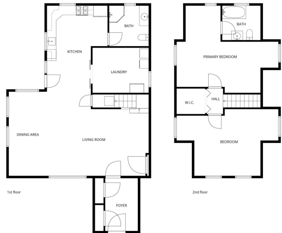
FLOOR PLAN CREATED BY CUBICAGA APP. MEASUREMENTS DEEMED HIGHLY RELIABLE BUT NOT GUARANTEED.

website: www.AffinityRealEstate.com | email: info@affinityrealestate.com | office: 218-237-3333 | fax: 218-237-3377