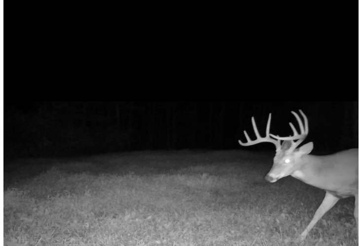
MOULTRIE PEQUOT 09/13/25 10:39 PM 71 °F