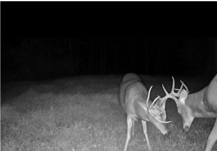
MOULTRIE PEQUOT 09/13/25 10:41 PM 73 °F