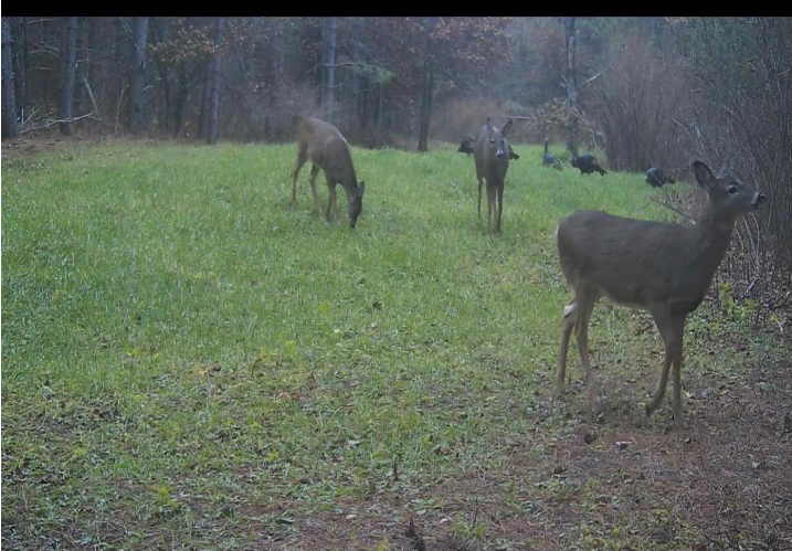
MOULTRIE PEQUOT 2 11/07/25 9:45 AM 33 °F