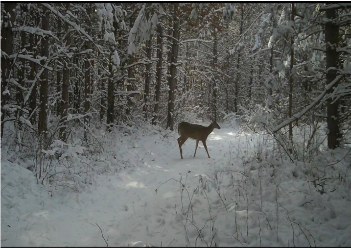
MOULTRIE Pequot trail 11/27/25 1:36 PM 20 °F