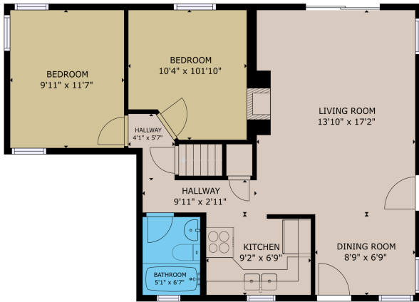
FIGURE 2 DESIGN: CONCEPT AREA FLOOR 1: 101'4" x 11' FLOOR 2: 107'4" x 11' FLOOR 3: 104'4" x 11' SIZES AND DIMENSIONS ARE APPROXIMATE. ACTUAL MAY VARY.