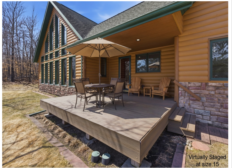
Virtually Staged at size 15