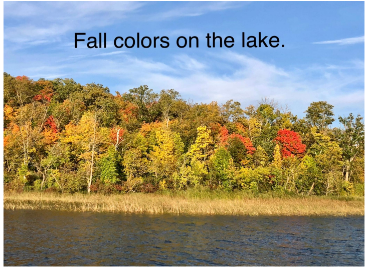
Fall colors on the lake.