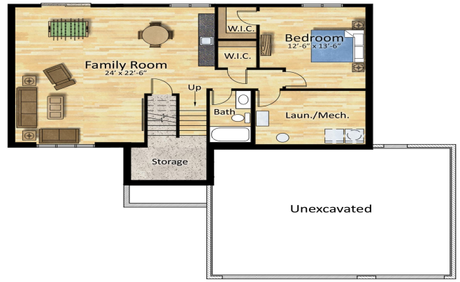
Lower Floor Plan