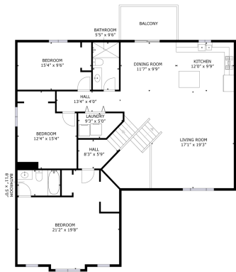
GROSS INTERNAL AREA FLOOR 1: 1270 sq.ft. FLOOR 2: 1657 sq.ft. TOTAL: 2927 sq.ft. SIZES AND DIMENSIONS ARE APPROXIMATE, ACTUAL MAY VARY.