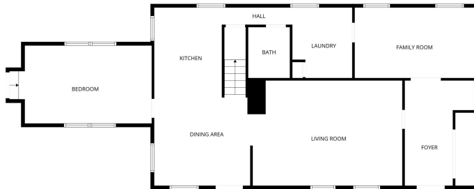
FLOOR PLAN CREATED BY CUBICASA APP. MEASUREMENTS DEEMED HIGHLY RELIABLE BUT NOT GUARANTEED.