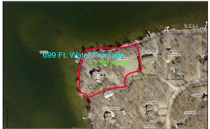
These data are provided on an "AS-IS" basis, without warranty of any type, expressed or implied, including but not limited to any warranty as to their performance, merchantability, or fitness for any particular purpose. 1.2.267 Date: 4/17/2026 2 Parcels Becker County