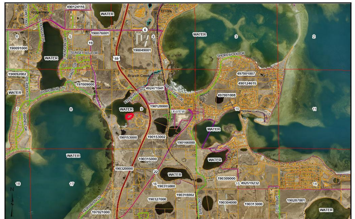
These data are provided on an "AS-IS" basis, without warranty of any type, expressed or implied, including but not limited to any warranty as to their performance, merchantability, or fitness for any particular purpose. 1.36.112 Date: 4/17/2026 Sallie to Detroit Becker County