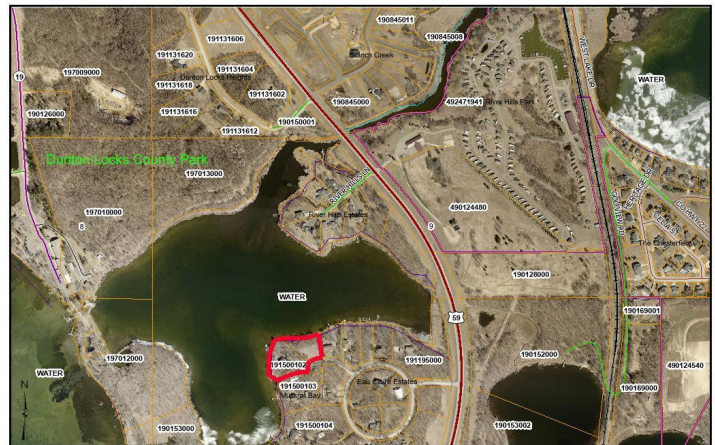
These data are provided on an "AS-IS" basis, without warranty of any type, expressed or implied, including but not limited to any warranty as to their performance, merchantability, or fitness for any particular purpose. 1.9.028 Date: 4/17/2026 Muskrat / Dunton Locks Becker County