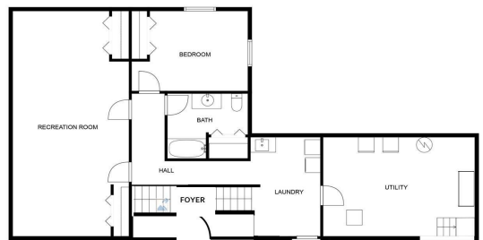
FLOOR PLAN CREATED BY CUBICASA APP. MEASUREMENTS DEEMED HIGHLY RELIABLE BUT NOT GUARANTEED.