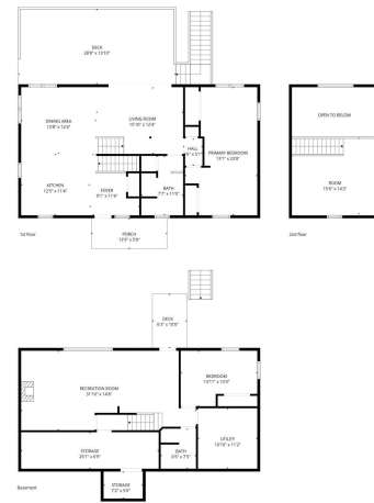
FLOOR PLAN CREATED BY CUBICASA APP. MEASUREMENTS DEEMED HIGHLY RELIABLE BUT NOT GUARANTEED.