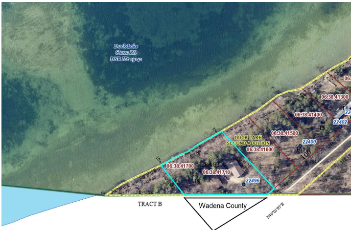
22496 Duck Lake Rd.