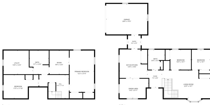
FLOOR PLAN CREATED BY CURICASA APP. MEASUREMENTS DEEMED HIGHLY RELIABLE BUT NOT GUARANTEED.