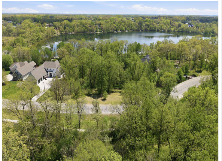
Douglas County, MN