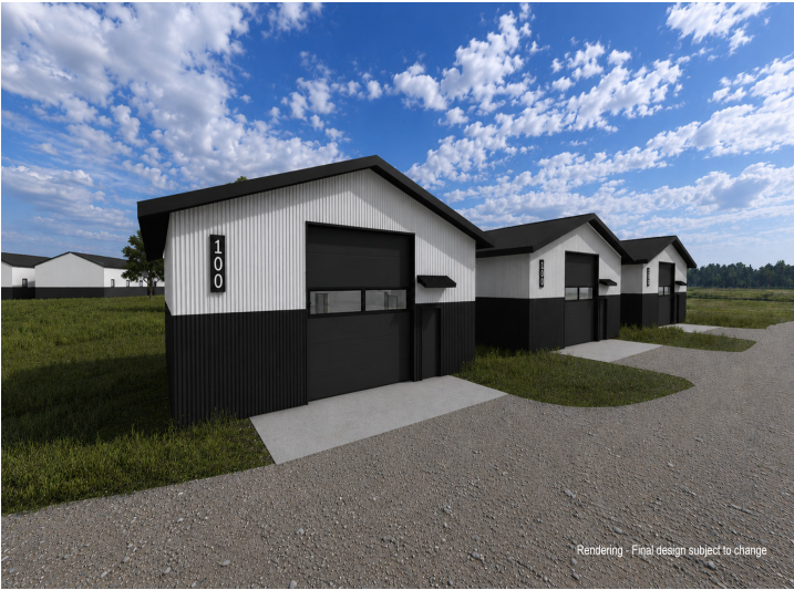
Rendering - Final design subject to change