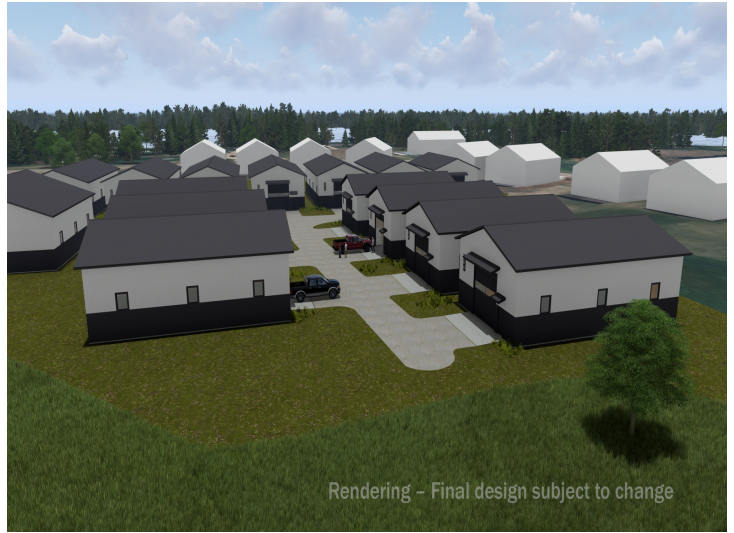
Rendering - Final design subject to change