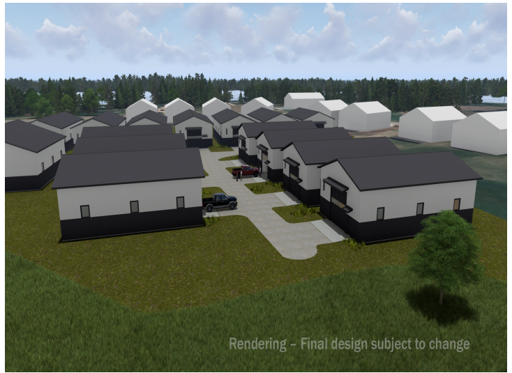
Rendering - Final design subject to change