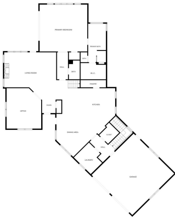
FLOOR PLAN CREATED BY CUBICSCAPE APP. MEASUREMENTS DEEMED HIGHLY RELIABLE BUT NOT GUARANTEED.