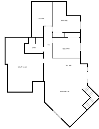
FLOOR PLAN CREATED BY CUBICSCAPE APP. MEASUREMENTS DEEMED HIGHLY RELIABLE BUT NOT GUARANTEED.