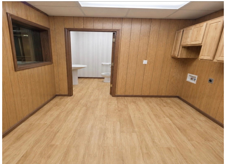
Douglas County, MN