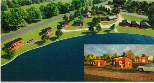
PELICAN LAKE RESORT