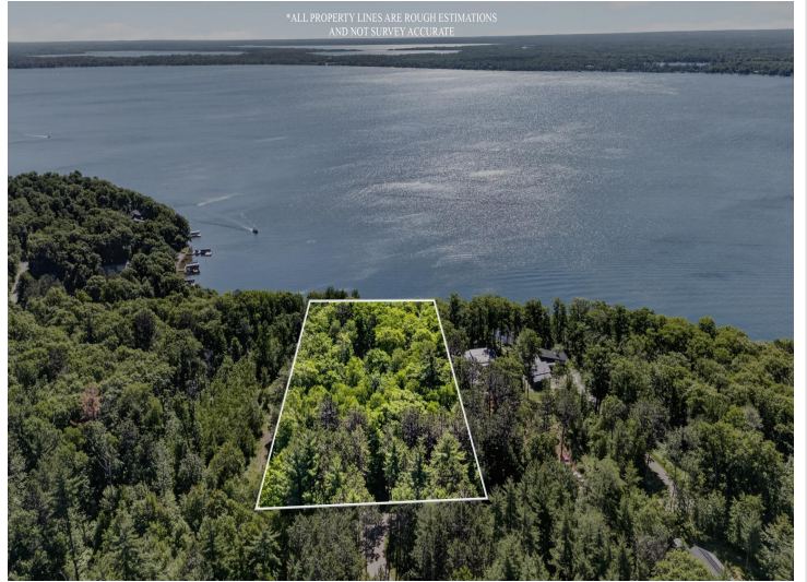
*ALL PROPERTY LINES ARE ROUGH ESTIMATIONS AND NOT SURVEY ACCURATE