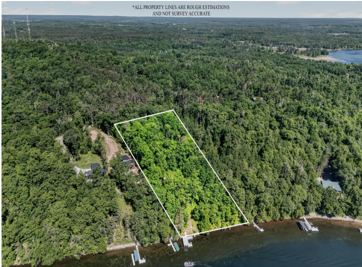
*ALL PROPERTY LINES ARE ROUGH ESTIMATIONS AND NOT SURVEY ACCURATE

website: www.AffinityRealEstate.com | email: info@affinityrealestate.com | office: 218-237-3333 | fax:218-237-3377