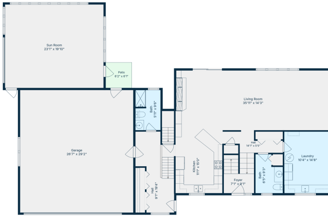
Floor Plan Created By Cubicasa App. Measurements Deemed Highly Reliable But Not Guaranteed.