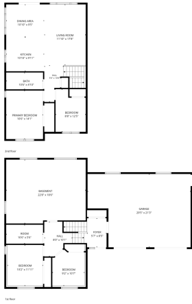
FLOOR PLAN CREATED BY EURICASA APP. MEASUREMENTS DEEMED HIGHLY RELIABLE BUT NOT GUARANTEED.