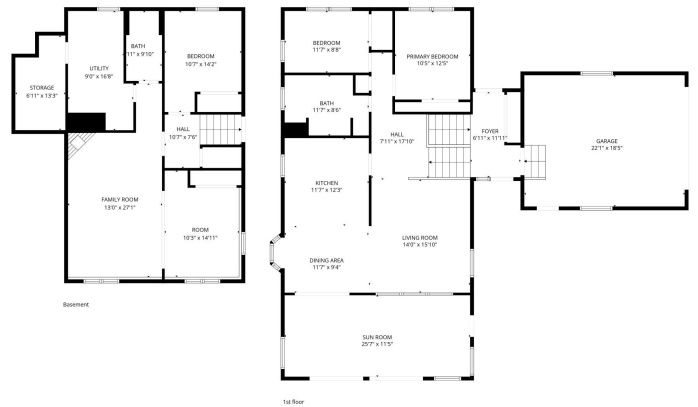
FLOOR PLAN CREATED BY CUBICSCAPE APP. MEASUREMENTS DEEMED HIGHLY RELIABLE BUT NOT GUARANTEED.