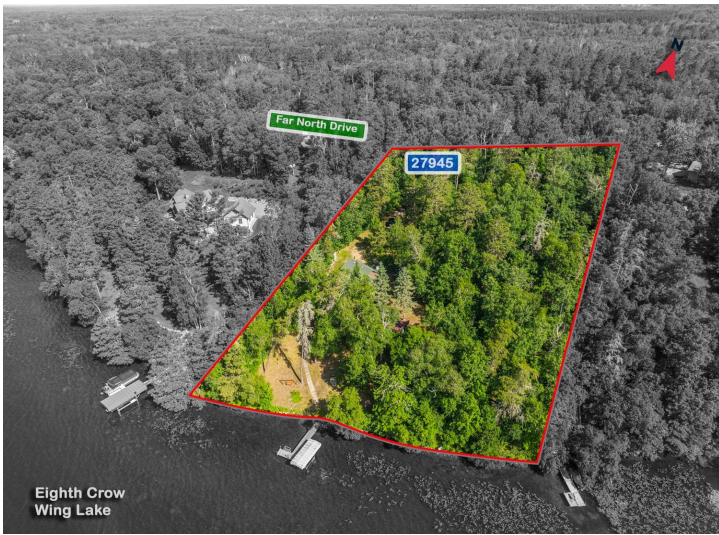
Eighth Crow Wing Lake