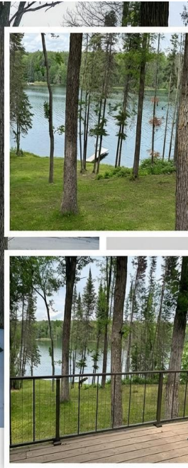
Lake Front Property Nearly 2 acres and 275 feet of shore line