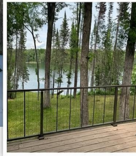
Lake Front Property Nearly 2 acres and 275 feet of shore line