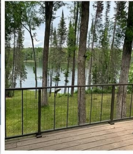
Lake Front Property Nearly 2 acres and 275 feet of shore line